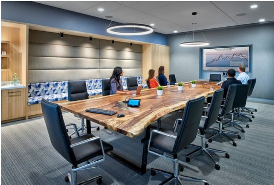
Mariposa's Headquarters in Guelph Ontario.